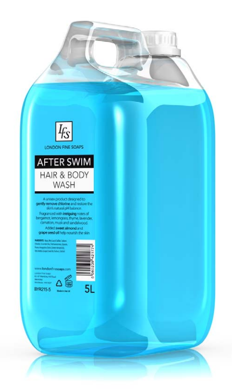
AFTER SWIM HAIR & BODY WASH

An energising combination of bergamot and green leaf fragrances, balanced by a warm musk undertone. With its rich lather, this body wash leaves guests feeling clean, fresh and revitalised.