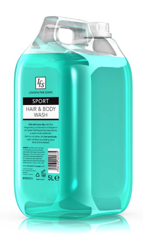
SPORT HAIR & BODY WASH

An energising combination of bergamot and green leaf fragrances, balanced by a warm musk undertone. With its rich lather, this body wash leaves guests feeling clean, fresh and revitalised.