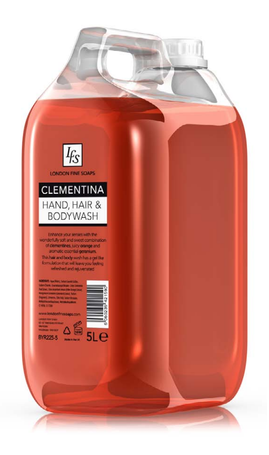
CLEMENTINA HAND, HAIR & BODYWASH

A unique combination of exotic kiwi and limes, with a hint of invigorating eucalyptus. Refresh the body, awakens the senses and stimulates the mind. Combine with Refrescar Conditioner and Refrescar Moisturiser for the complete guest experience.