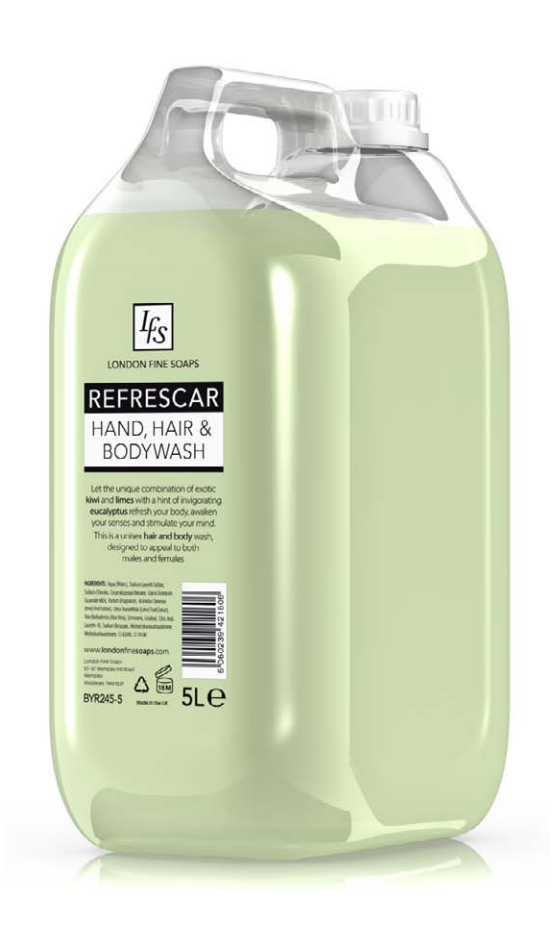
REFRESCAR HAND, HAIR & BODYWASH

Enriched with soothing aloe vera. Fragranced with a refreshing blend of bergamot, eucalyptus, hints of lavender and lemongrass, and a soft sandalwood undertone. This hair and body wash revitalises the senses whilst moisturising the skin.