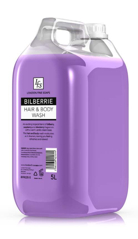
BILBERRIE HAIR & BODY WASH

Designed to gently remove chlorine and help restore the skin's natural pH balance. Fragranced with bergamot, lemongrass, thyme, lavender, carnation, musk and sandalwood. Added sweet almond and grape seed oil help nourish the skin.